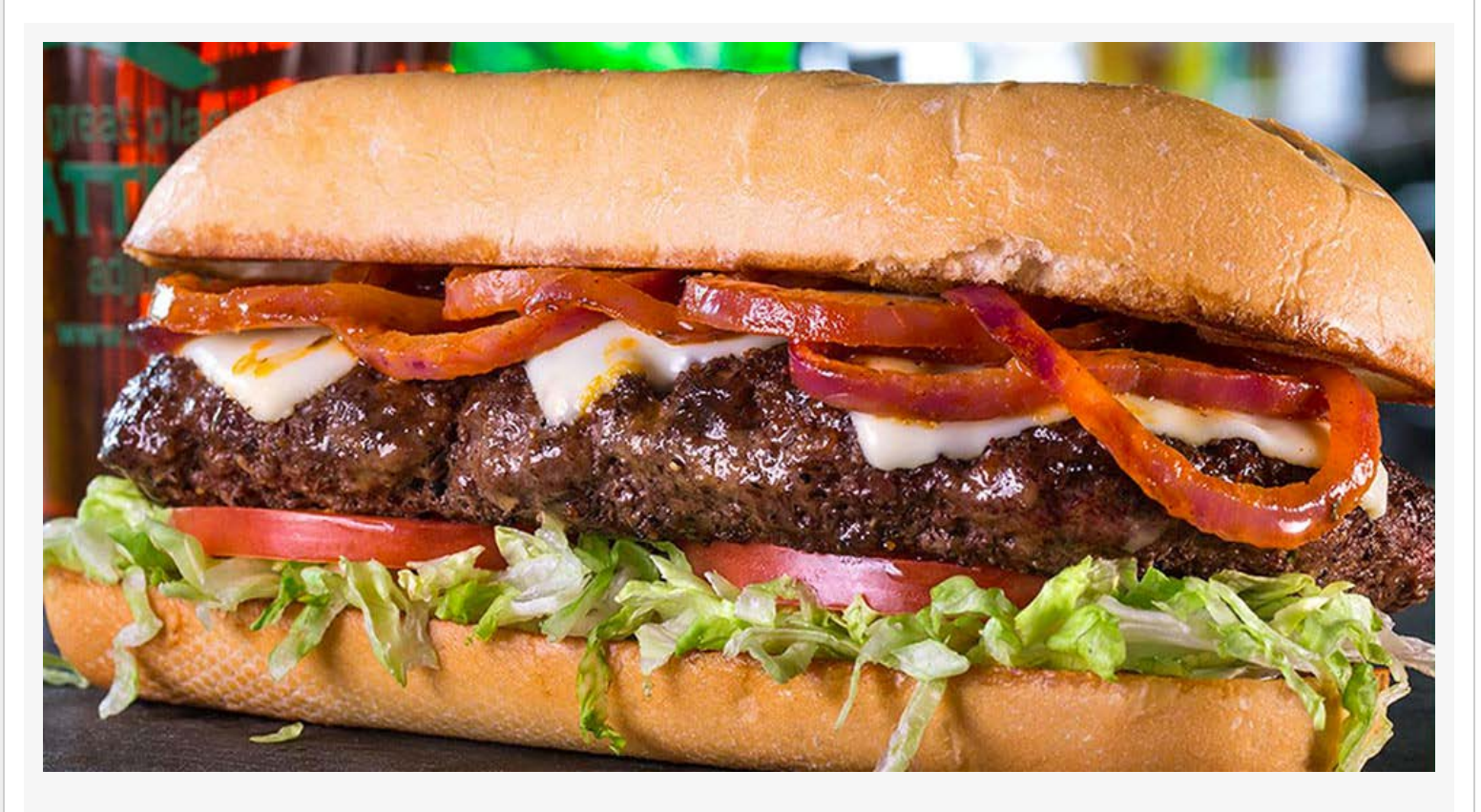
Quaker Steak & Lube Brings Back Classic Favorites & Fresh New Cocktails